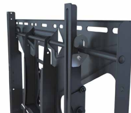
Mounting brackets allowing for 12° of continuous tilt