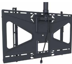
Ability to mount from the ceiling