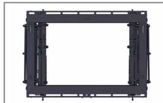
Open frame design allows for quick and easy access to cables and wiring