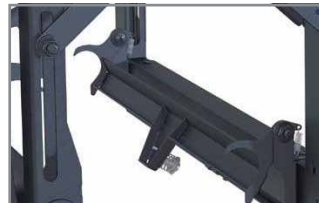
Spring-loaded locking mechanism provides quick release in under 5 seconds