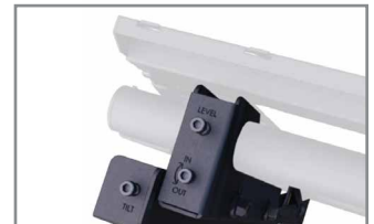
Top-adjustable fine-tune mounting points allow for post-installation alignment