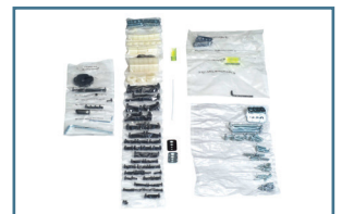
Includes universal mounting hardware kit