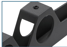
Dual 2-inch openings allow the arms to slide over the tops of poles