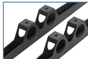
Raise or lower UFA by loosening Allen screws