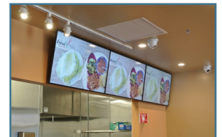
The most cost-effective digital menu board mounts on the market today