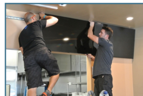
Allows video walls and digital displays to be positioned flat or up to 15 degrees