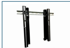
Installation safely secures digital signage in place