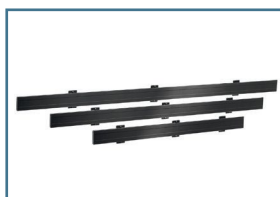
Interface bars are available in multiple lengths