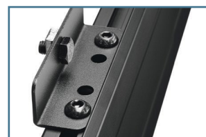
L-brackets can be moved anywhere along interface