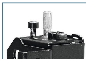
Easy to install display brackets with 6-point (x,y,z)